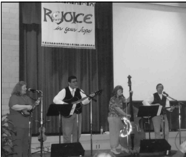
Homeward Bound heats up the stage

The Berge Family , Homeward Bound , and Just Friends , three Blue Grass Gospel music groups from northern Minnesota, generously donated their time and talent by performing at a music festival which had as its focus Kidstown's ministry to Romanian orphans.