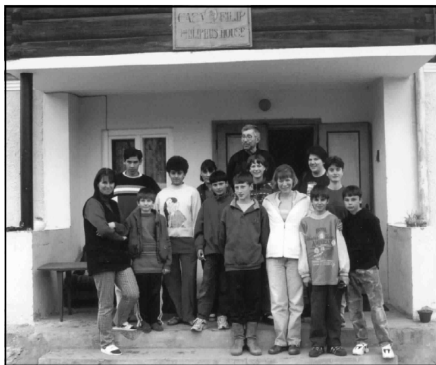
Children from Casa Filip happily pose for a photo