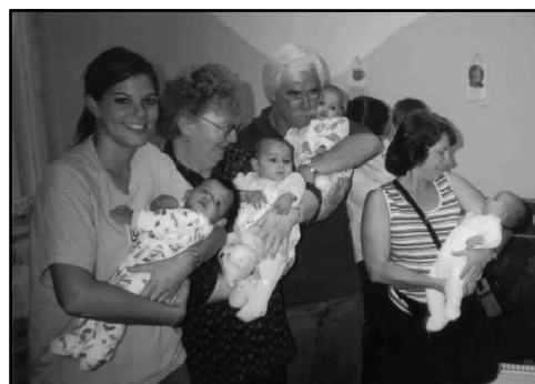
Infants, abandoned by their parents, live sad lives in government orphanages.

The revolution in Romania occurred over 13 years ago. Shortly afterwards the West was allowed its first glimpses into Romanian orphanages. Images of countless children crammed into understaffed, underequipped, and poorly maintained government-run institutions stunned viewers. Children were seen rocking themselves; some were not able to speak, walk, or function normally. Ceausescu's bitter legacy was finally unearthed. This was the Romania of 1989. A Westerner would assume that after the media exposed the horrid conditions of those orphanages, and after the significant emphasis on international adoptions, the orphan "epidemic" should be nearly a thing of the past. This can't be farther from the truth. More than a decade has passed since Ceausescu's population growth policies, yet thousands of children remain in state institutions.